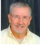
Bruce Recruiting, Ltd. www.brucrecruitingltd.com

Thank you to our sponsors. We appreciate your support!