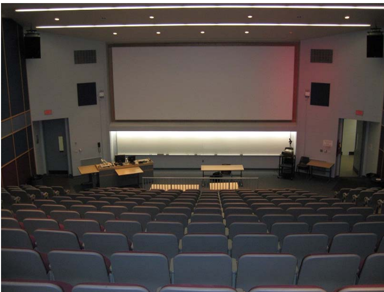
Applied Arts Room 210 - University of Wisconsin Stout

Applied Arts Room 210 University of Wisconsin - Stout 712 S Broadway Menomonie, WI 54751